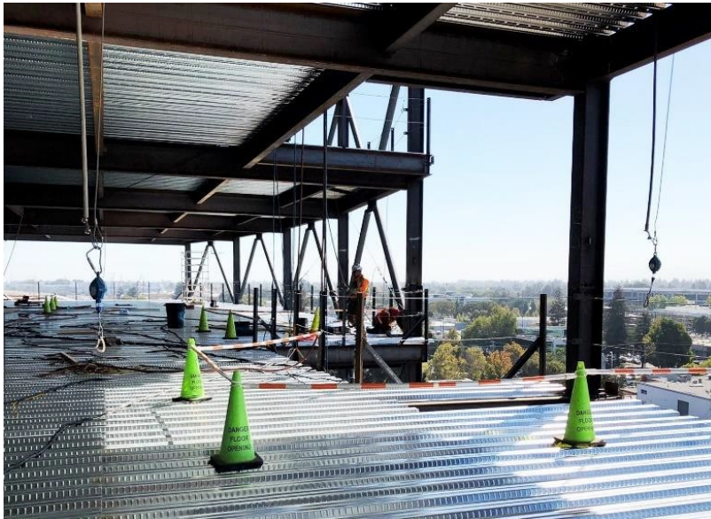
Figure 1635-2. CBB System In-Use

NOTE: Authority cited: Section 142.3, Labor Code. Reference: Section 142.3, Labor Code.