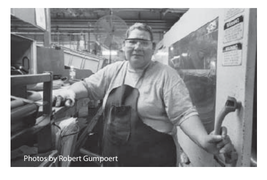
Minimizing the impact of work-related injuries and illnesses

Tell your supervisor right away. If your injury or illness developed gradually (like tendinitis or hearing loss), report it as soon as you learn or believe it was caused by your job.