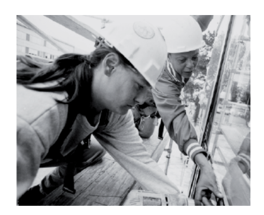
Monitoring the administration of claims