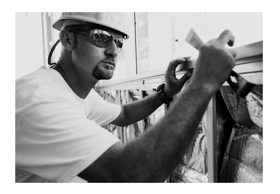
Helping resolve disputes over workers' compensation benefits