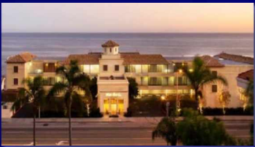
Malibu Beach Inn