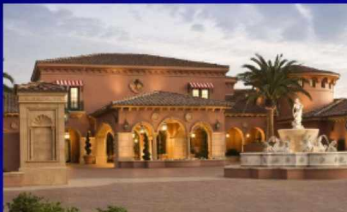
Grand Del Mar