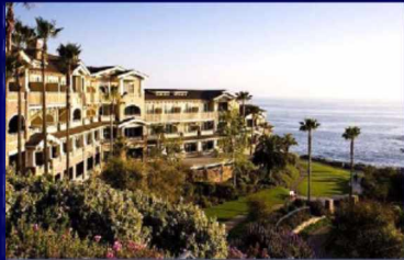
Montage Laguna Beach