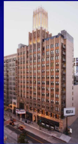
Ace Hotel Downtown Los Angeles