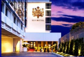
SLS Beverly Hills