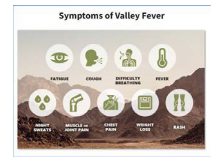
OHB recommends that wildland firefighters and firefighters responding to fires in the wildland-urban interface are trained on Valley fever and encouraged to report symptoms that could be from Valley fever.