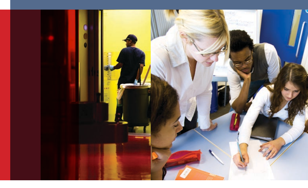
Promoting Safe and Healthy Workplaces for California's School Employees

The Commission on Health and Safety and Workers' Compensation (CHSWC)