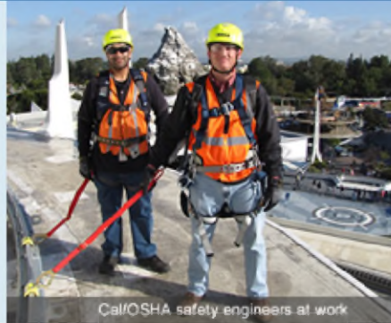
Cal/OSHA safety engineers at work