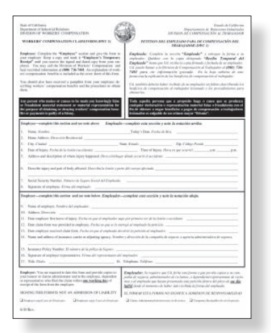
Workers' Compensation Claim Form (DWC 1)

Give or mail the form to your employer. This is called "filing" the claim form. If mailing, use first-class or certified mail, and buy a return receipt. If you do not know where to send the form, you can ask the I&A officer for help.