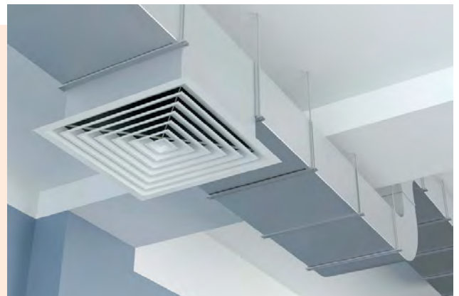
Ventilation Strategies to Control COVID-19 Transmission in Skilled Nursing Facilities Part 1 | Part 2

Staff also presented a webinar on “Respiratory Protection Programs in Long Term Care Facilities During the COVID-19 Pandemic” to 390 staff in long term care settings statewide to assist them in developing or refreshing their respirator programs to better protect their staff. The webinars were followed by question-and-answer sessions and opportunities for phone or e-mail consultations on improving their respiratory protection programs and ventilation practices.