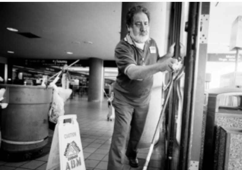
Janitors work to keep facilities — including Los Angeles International Airport — clean and maintained.

Industry changes — from a system where retailers employed the janitors who cleaned their establishments to one where prime and subcontractors employing janitors do the work — allowed unscrupulous companies to set in motion labor law abuses now so prevalent the combined, systematic action of several agencies is needed to combat them.