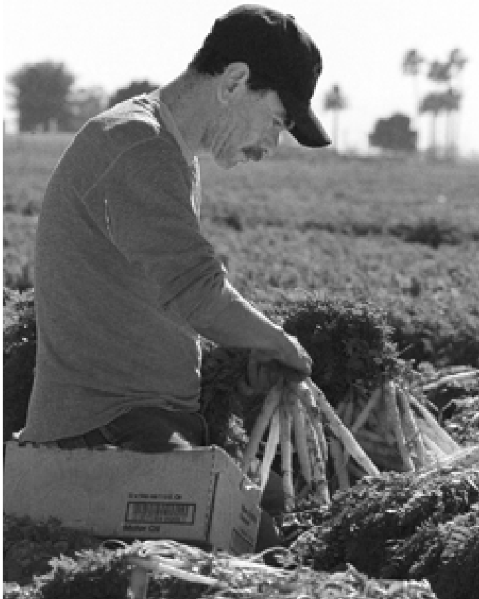
SB 1125 amends Labor Code Section 1684 so that surety bonds and funds in the farm worker remedial account can be used to pay civil penalties.

Discrimination: AB 1015 extends anti-discrimination protections under Labor Code Section 96(k) to job applicants, giving the labor commissioner authority to accept claims filed by applicants -- in addition to claims from employees discharged, demoted or suspended in retaliation for engaging in lawful conduct during non-work hours away from the employer's premises. Exceptions to 96(k) allow fire departments to prohibit fire fighters from using tobacco products on or off the job and allow employers to prohibit employees from engaging in off duty