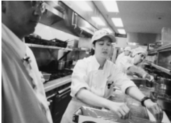
DIR’s new workers’ portal will make labor, safety and workers’ compensation information easy to access.

Work it out, the Department of Industrial Relations’ new workers’ portal, will premiere in late June at the department’s 75th anniversary celebration in San Francisco.