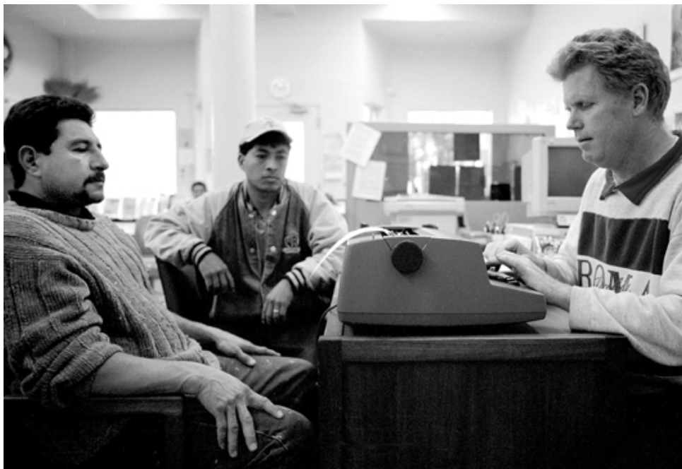
Janitors get help with wage claims from worker advocates at San Francisco's Instituto Laboral de la Raza.