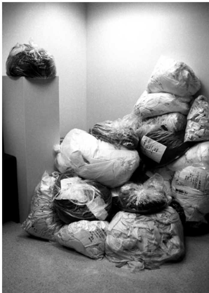
State investigators confiscated 23 bags of garments from Wins of California.

Balter subpoenaed records from the manufacturers and retailers who contracted with Wins companies to determine their potential liability for wages as the DLSE and DOL staff neared completion of an audit of Wins records. The sum owed to workers now totals around $1.3 million