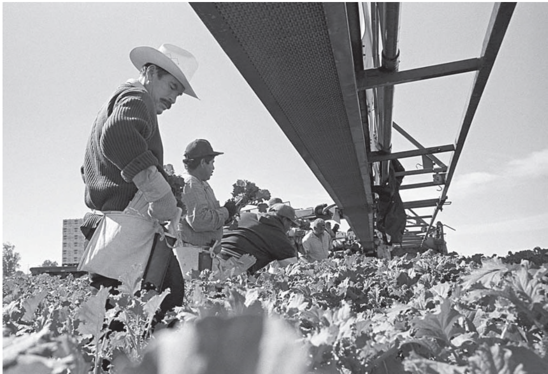
Growers and others that hire farm labor contractors must provide evidence they have verified the validity of the FLC's license.

The license verification unit helps agricultural growers comply with regulations that became effective July 1 as part of Assembly Bill 423. Growers must now provide evidence they have verified the licenses of farm labor contractors prior to entering a contractual agreement.