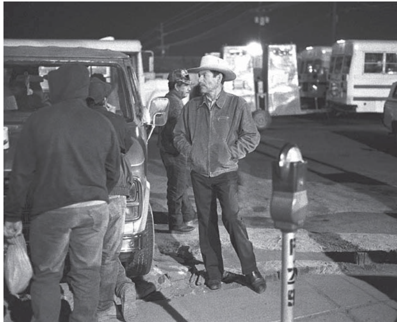
Farm labor contractor licensing services are now available throughout the state.

Once a farm labor contractor registers, they are sent a license renewal package every year 90 days in advance of their license expiration.