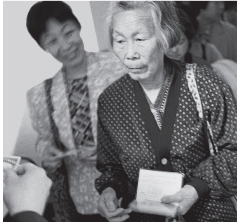
Wins workers received checks in amounts ranging from $250 to over $10,000.