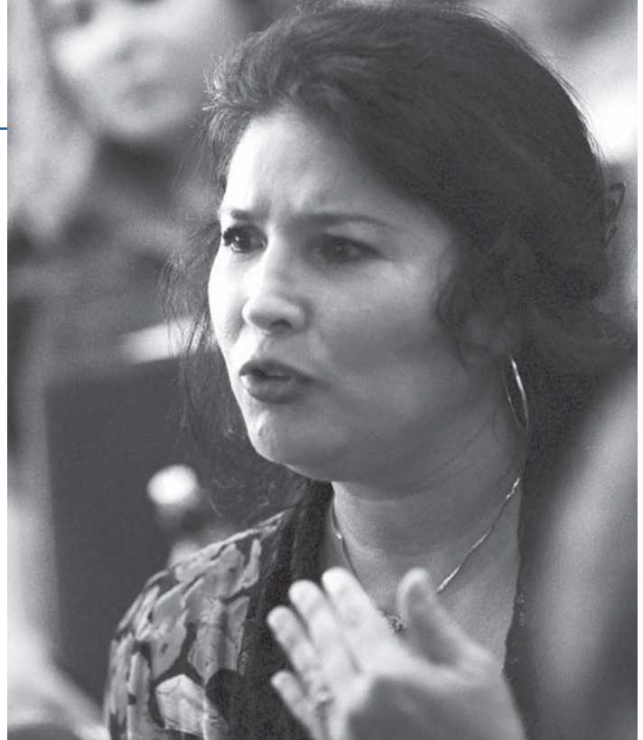
Employment Development Department employees asked questions about the role of the new Labor and Workforce Development Agency at a training session in Salinas.

So important are improved enforcement efforts that when labor agency staff and representatives from unions and community organizations met during a two-day strategic planning workshop in September, one of the four priorities they outlined for the future of the agency was to strengthen enforcement efforts by developing an internal case management system and coordinating collection between EDD and DIR. ■