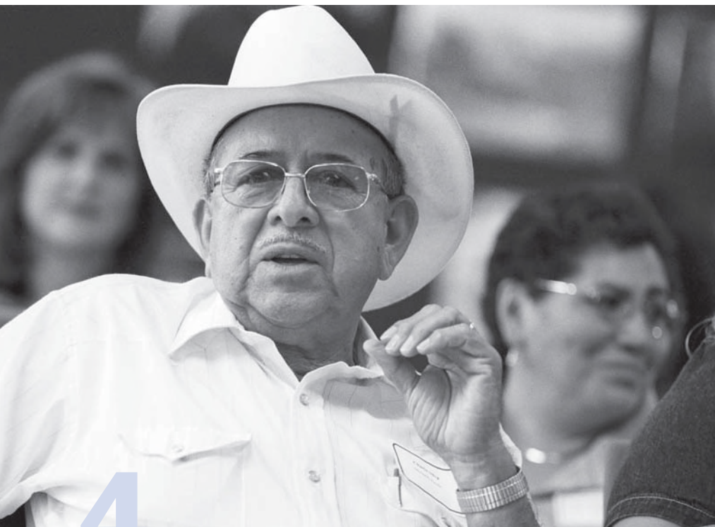
Agricultural employers attended a training in Salinas to learn about labor and employment laws affecting their business.