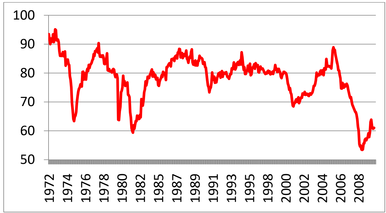
Chart 3. Percent Capacity Utilization: Wood Products Industry