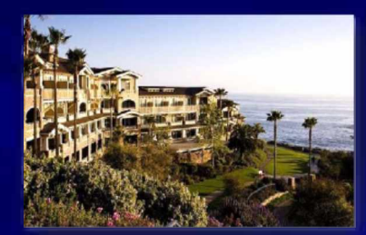
Montage Laguna Beach