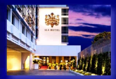
SLS Beverly Hills