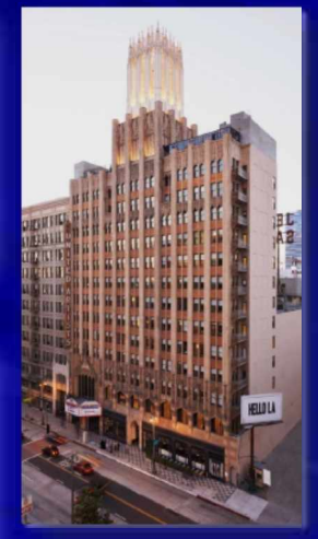
Ace Hotel Downtown Los Angeles