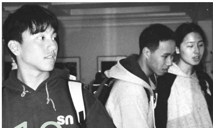
Lewis Hine's photographs show students from San Francisco's Galileo High School what child laborers endured before laws to protect them were passed.