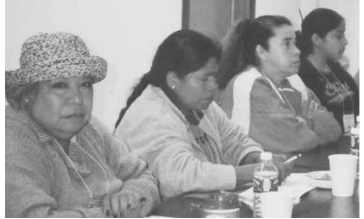
DLSE helped Lideres Campesinas provide training on child labor laws to 37 farmworker women in April.