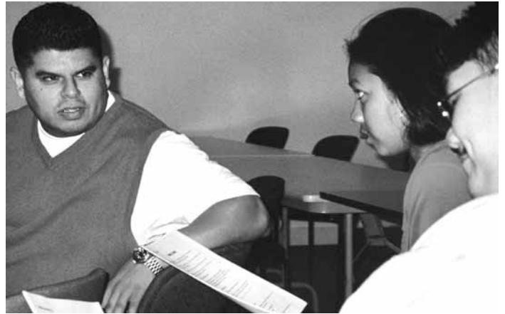
Students from Oakland High School strategize prior to acting out a scene in which they've been instructed by an employer to do a hazardous job.