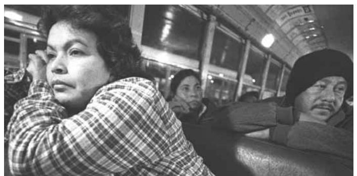
When workers owed back wages have moved and can't be found by DLSE, consulates can contact them through the Metricula Consular , a system the Mexican government uses to identify its citizens.