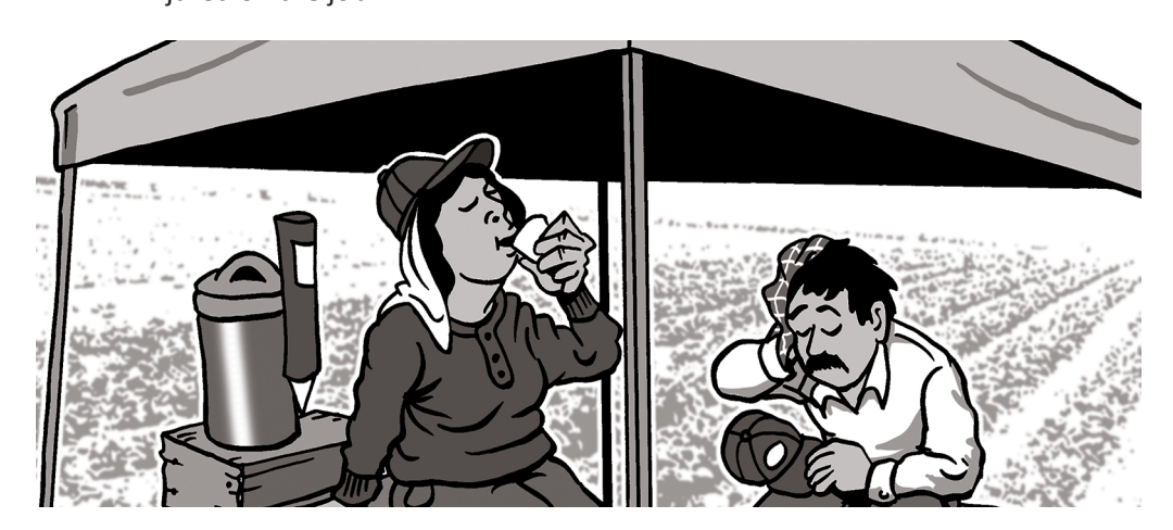
Employers must provide what is needed to keep you safe.