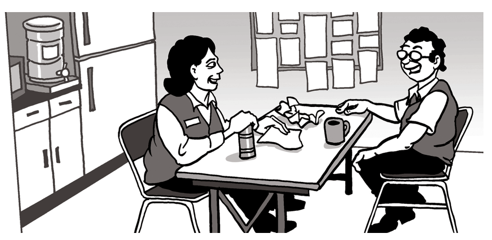
You have the right to take breaks.