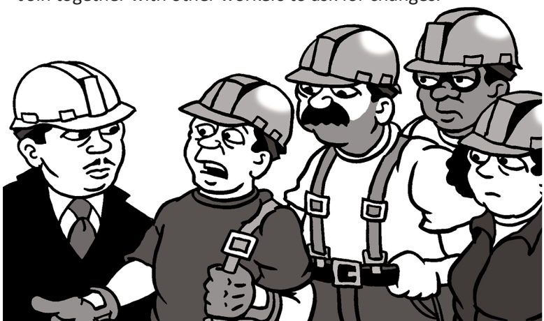
You can join with other workers to ask for changes.

The law says it is illegal for employers to threaten or retaliate against you for taking these actions.