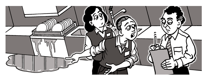
The law protects you when you speak up about safety.