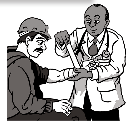
If you are injured, you have the right to medical care.

Ask for medical help right away. If it's an emergency, call 911 or go straight to an emergency room.