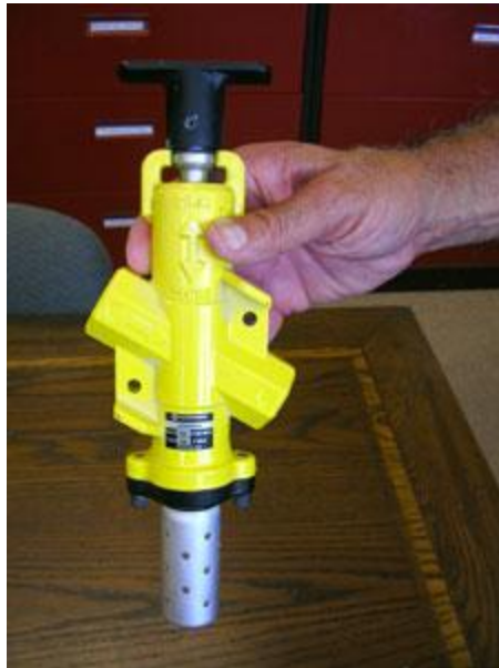
Cord and plug lockout device