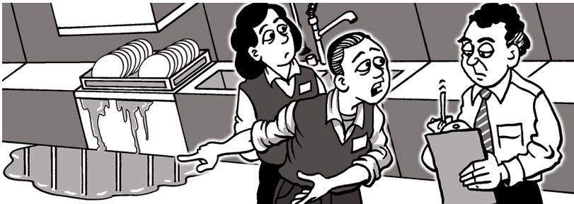
The law protects you when you speak up about safety.