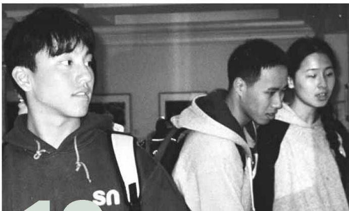
Lewis Hine's photographs show students from San Francisco's Galileo High School what child laborers endured before laws to protect them were passed.