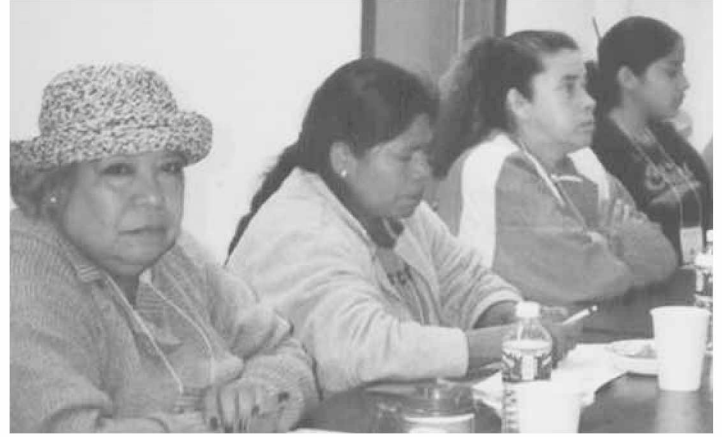
DLSE helped Lideres Campesinas provide training on child labor laws to 37 farmworker women in April.