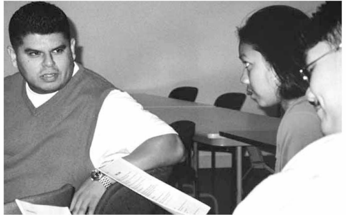
Students from Oakland High School strategize prior to acting out a scene in which they've been instructed by an employer to do a hazardous job.