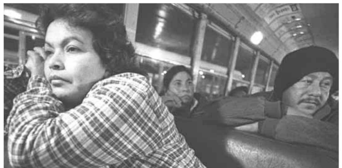
When workers owed back wages have moved and can't be found by DLSE, consulates can contact them through the Metricula Consular , a system the Mexican government uses to identify its citizens.